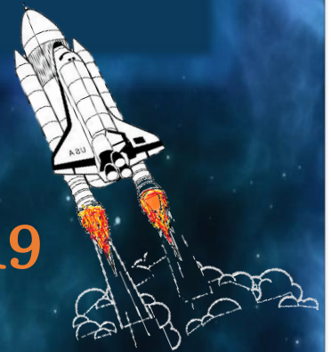
Exhibit Dates January 22 – May 19, 2019