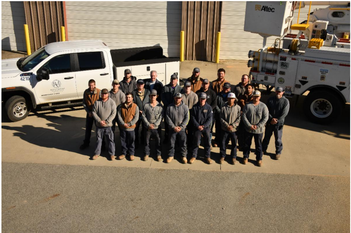
Pictured are employees in the Energy Resources Department - Electric Division

A Monthly Newsletter for the City of Rocky Mount Customers