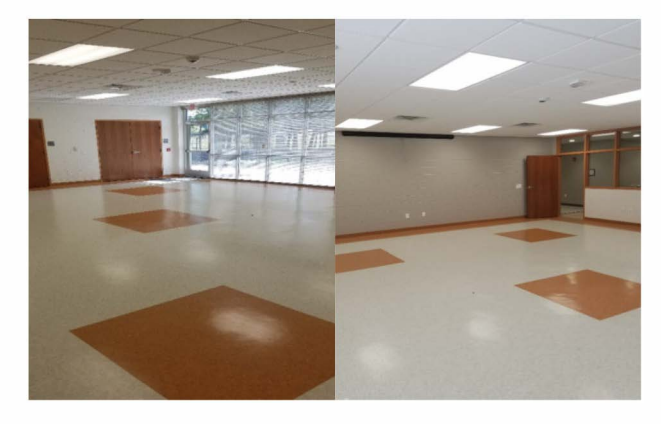
Medium Meeting Room: - Capacity: 60 Rental Rate: $50 per hour city resident, $65 non-resident