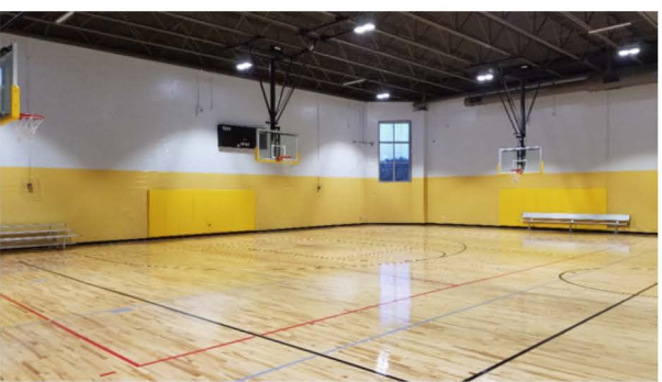
Gymnasium Rental Rate: $150 per hour city resident, $225 per hour non-resident. A minimum of 2 hour rental