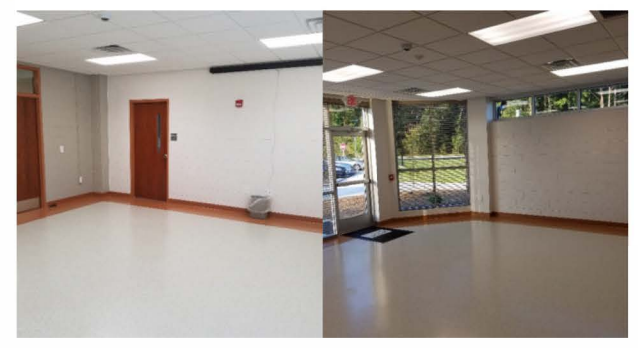
Small Meeting Room - Capacity: 30 Rental Rate: $30 per hour city resident, $45 non-resident